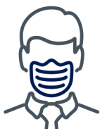
WEARING A MASK

Prevent the spread of infection by always doing the following: