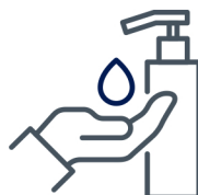
WASHING YOUR HANDS REGULARLY